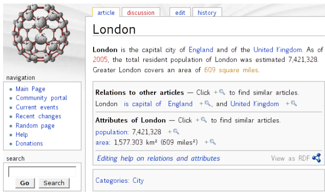
Figure 2: A semantic view of London.

in Figure 2 looks as in Figure 3. In Wikipedia, links to other articles are created by simply enclosing the article names in double brackets. Classification in categories is achieved in a similar fashion by providing a link to the category. However, category links are always displayed in a special format at the bottom of an article, without regard to the placement of the link inside the text.