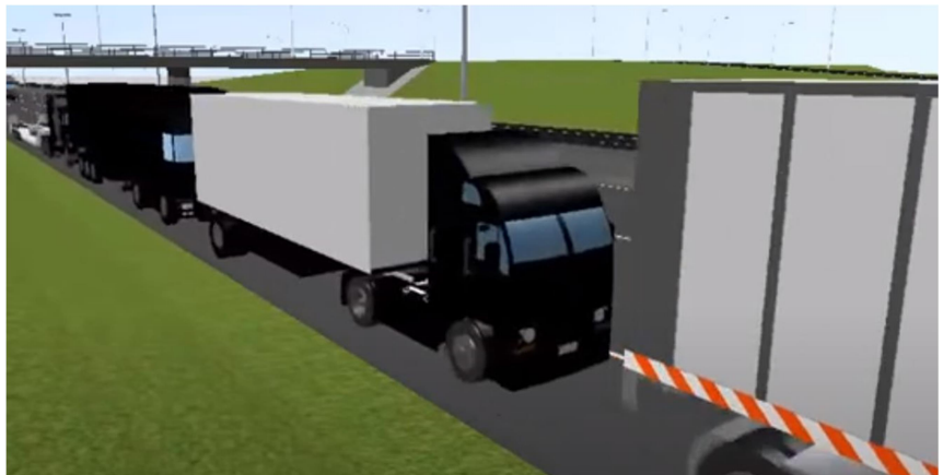
Figure 2: PTV simulations.

Respective simulations in a realistic setting can be performed in PTV Vissim<sup>1</sup>. We also believe that ethical dilemmas would benefit from a 3D visualization<sup>2</sup> for a wider outreach.